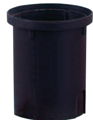
POLYPROPYLENE HOUSING FOR RECESS (Included)